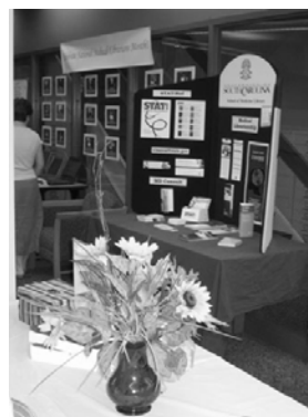
Photos of the Digital Showcase