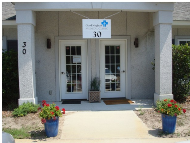
Good Neighbor Medical Clinic (Beaufort, SC)