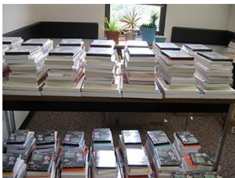
Stacks of materials ready to be delivered across the state