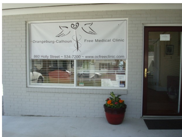
Orangeburg-Calhoun Free Medical Clinic