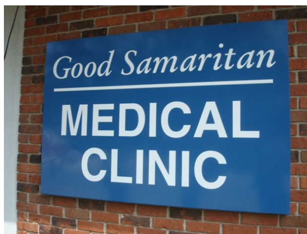
Good Samaritan Medical Clinic (Chester, SC)