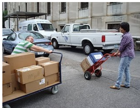
Loading and unloading boxes of materials