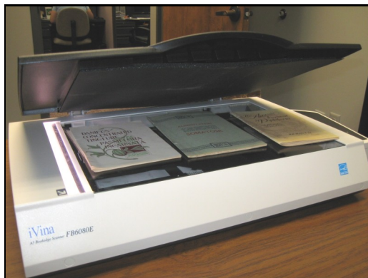
Flatbed book-edge scanner